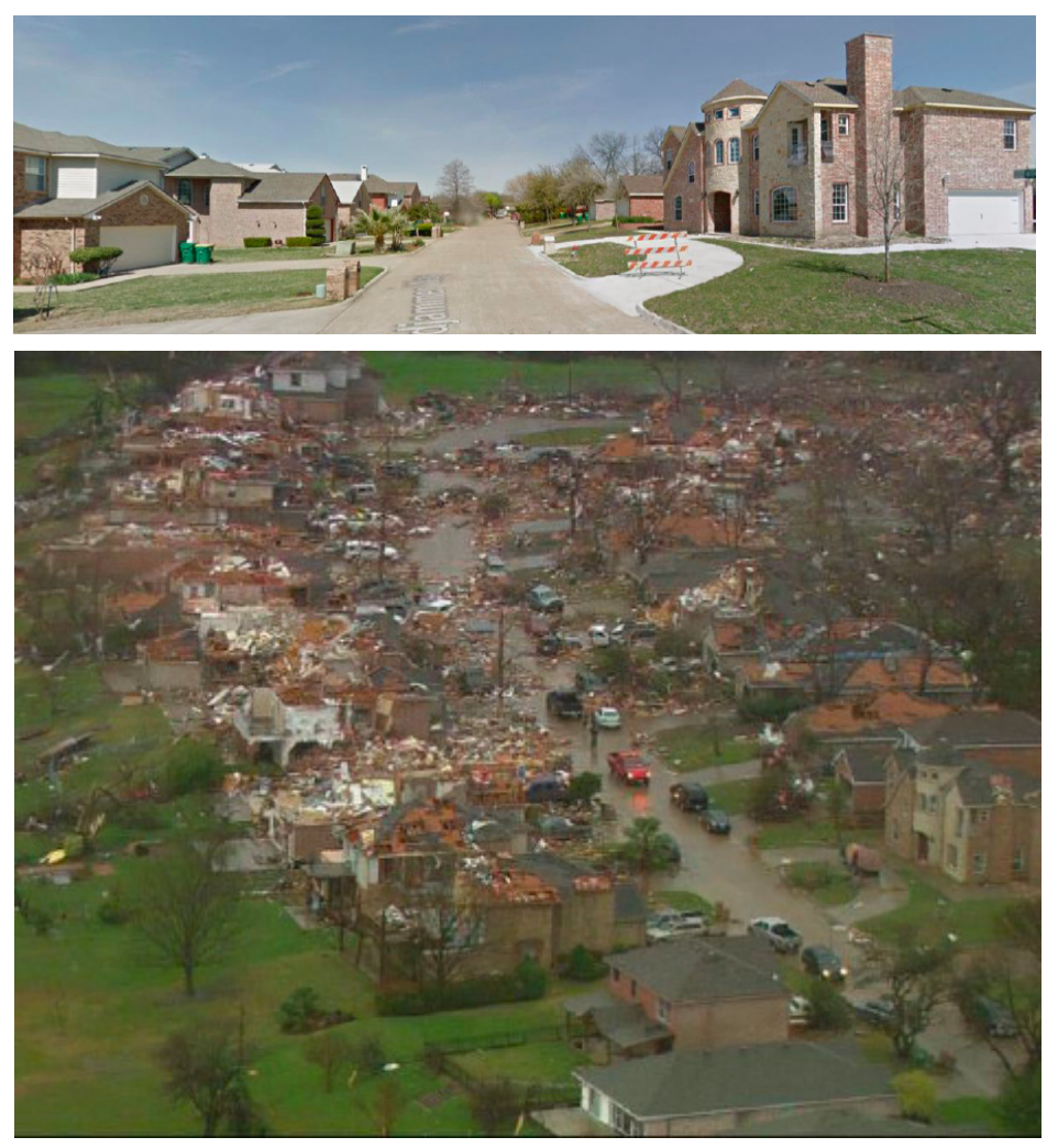
Before and after view of damage from December 2015 tornado in Rowlett, Texas.