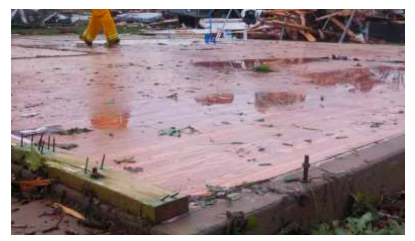
Complete destruction of home with anchor bolts just south of Hwy 377 & N. of Acton Highway in Granbury, TX. Although anchor bolts were used, the use of small washers reduced the impact of this reinforcement. Further, the lack of metal ties connecting the studs to the sill plate resulted in a weak link in the vertical load path from the studs to the sill plate.

Prevatt is pleased to note that in 2015, Moore, Oklahoma, became the first community in the U.S. to adopt tornado-resilient structural design provisions. Positive change, stimulated in part by this research, is underway.