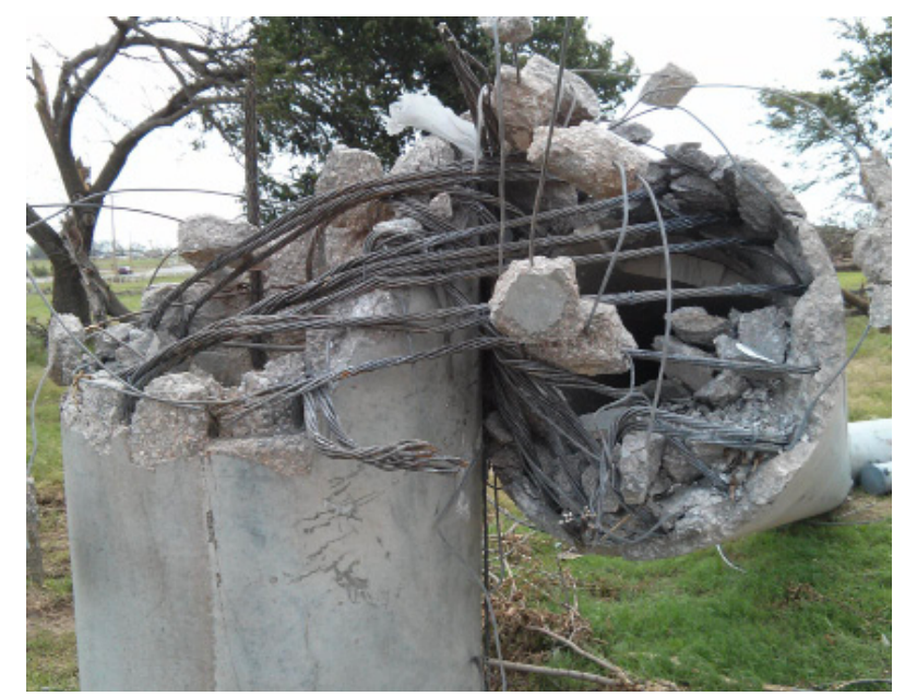
Reinforced concrete post, toppled by a tornado, May 2013, Moore, OK.

Over the course of the project, which lasted six years (2012-18), the WHDAG self-published 17 Preliminary Damage Reports following the occurrences of tornadoes, hurricanes and straightline wind events.