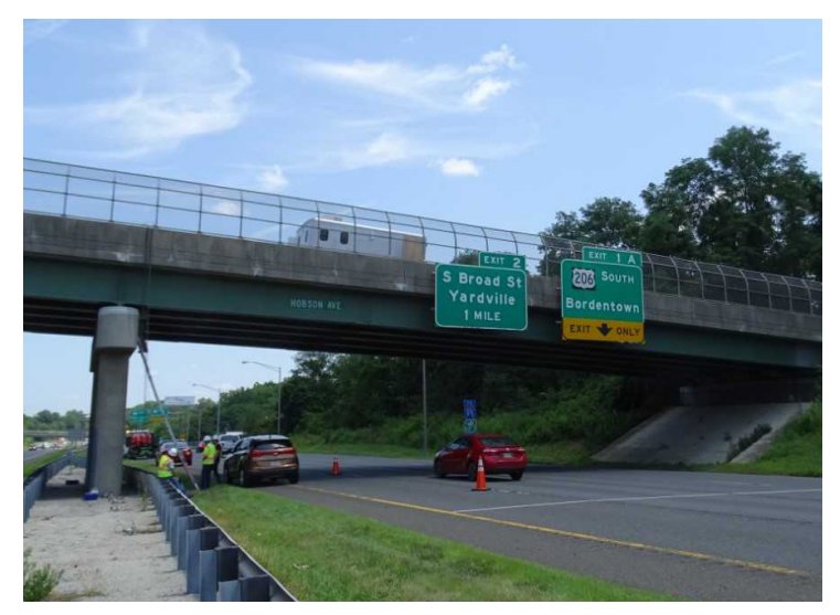
A side view of the Hobson Avenue Bridge over Interstate 195 in Hamilton Township, New Jersey.

(3) Increasing the dynamic load magnitude leads to clearer transfer functions and phase angle measurements, allowing a better identification of dynamic characteristics such as resonant frequencies.