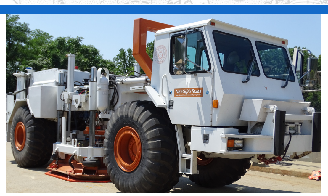
T-Rex on the Hobson Avenue Bridge over Interstate 195 in Hamilton Township, New Jersey.