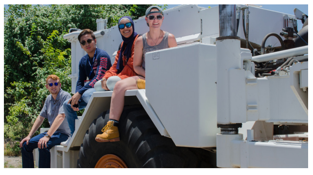
Travel funding provided, including stipend for room and board for the 10-week summer program. Underrepresented minority, women, and veteran undergraduate students are encouraged to apply.