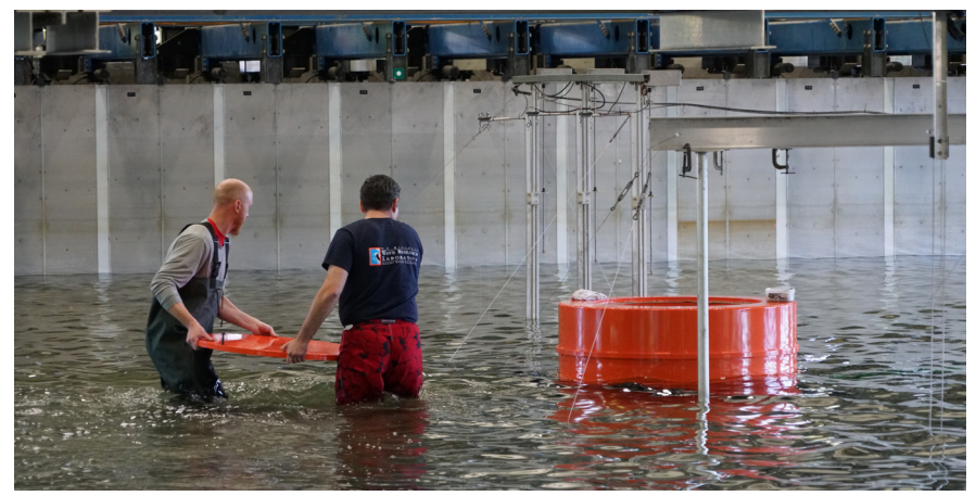
Undergraduates participate in hands-on, research-based projects in earthquake, wind, tsunami, or coastal engineering. Sites also include data management and cyberinfrastructure components.

Oregon State University University of California, Davis University of California, San Diego University of Washington